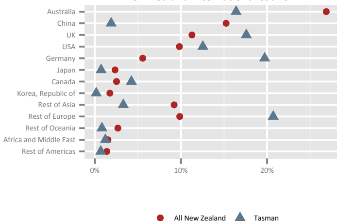
International tourist spend in Tasman compared to all New Zealand international tourism