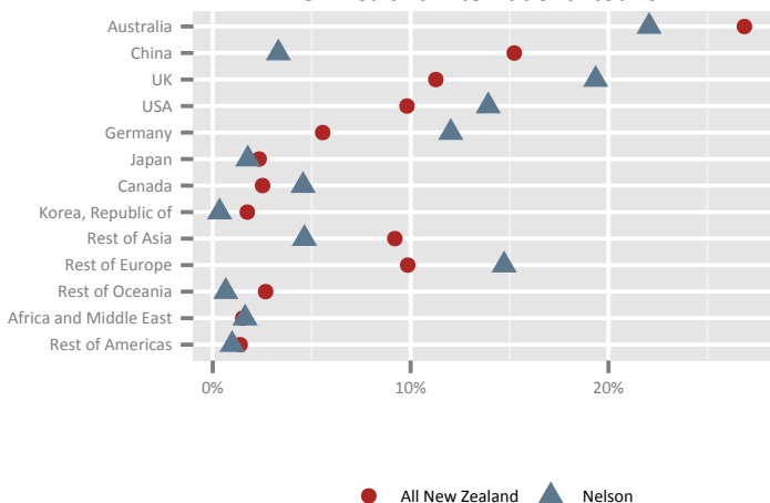
International tourist spend in Nelson compared to all New Zealand international tourism